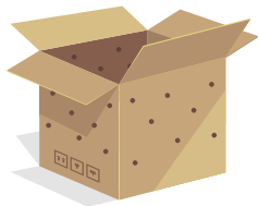
Dark cardboard transport box with ventilation holes.

Leave the bird where it is, as this is a normal stage in the life of a young bird. It will be taking flight very soon, with its parents watching from a distance.